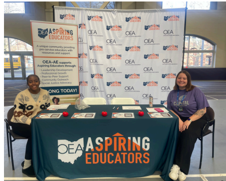
Our Wonderful Capital University AE Members

We had the opportunity early in March to connect with our future AE members at the state EdRising Conference at Capital University—where high school students stopped by our table for their very own “signing day” activity. These students are committing to becoming future educators and we can’t wait for them to join us as they graduate high school and start their college experiences. Shout out to two of our AE members from Capital University who joined us during their spring break to engage with the EdRising members on this two-day event!